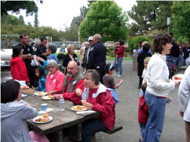
Cherryhill Neighbors enjoying the Party