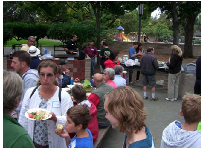
More Cherryhill Neighbors enjoying the party