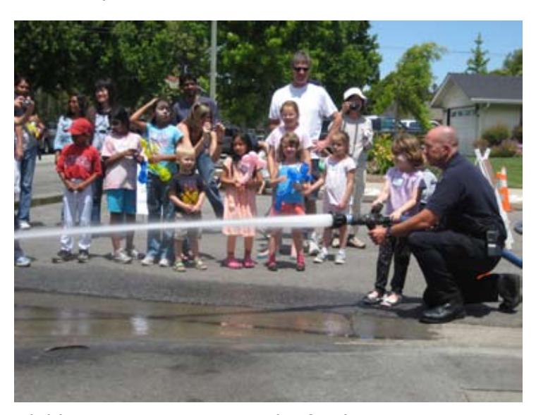
Children enjoy testing out the fire hose