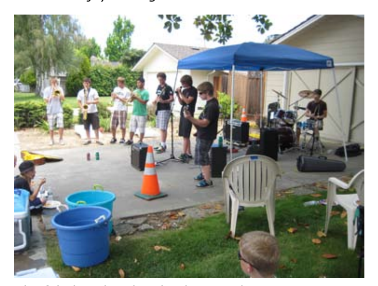
The fabulous band rocks the crowd

More photos from the block party may be found on the CherryHill NA website: http://www. cherryhillna.org