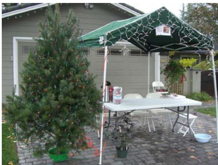
The Syracuse stop featured festive holiday lights!