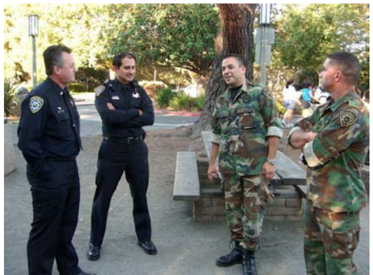
Sunnyvale Public Safety Officers.

More photos from National Night Out may be found at: http://www.cherryhillna.org