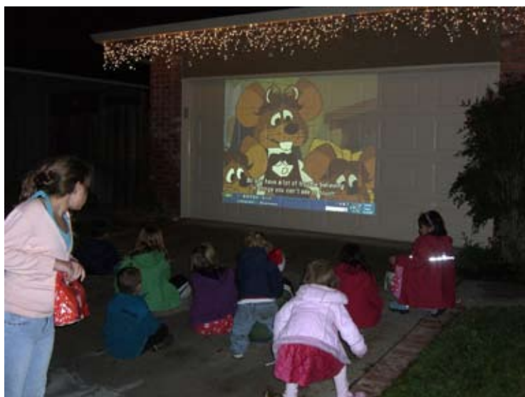
Children enjoyed the outdoor movie theater.

More photos from the Holiday Walkabout may be found at: http://www.cherryhillna.org