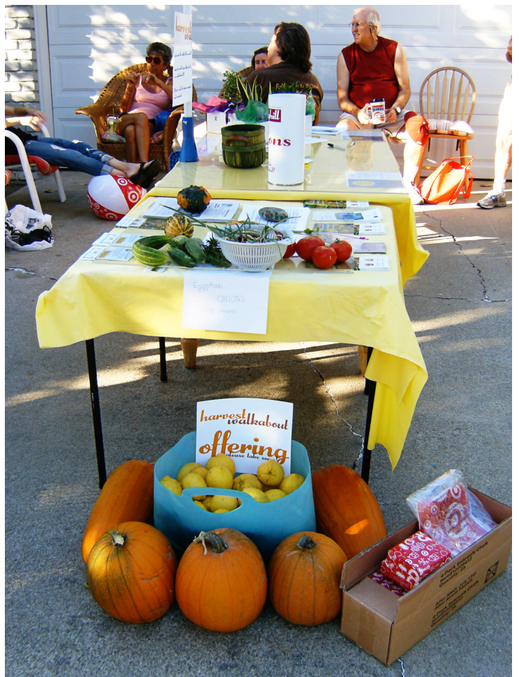
Neighbors greatly appreciated all the seating at the final stop!