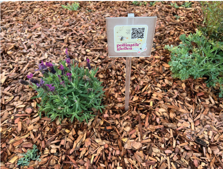
Be on the lookout for pollinator-friendly plants such as lavender and CA poppies.

Last year's grant project—focusing on plants that provide food and shelter to pollinators such as bees and butterflies—is underway. When walking throughout the neighborhood be on the lookout for the small signs below; each indicates a garden registered with the project. The QR code links to the grant page on cherryhillna.org and will tell you more about the pollinator-friendly spaces we are creating (including a map of where to find the 20 or so with signs). If you have pollinator plants in your front garden and would like a sign, please email Kathy Besser ( khb@graystar.com ). Get ready for a beautiful floral display (and walking tour) this spring!