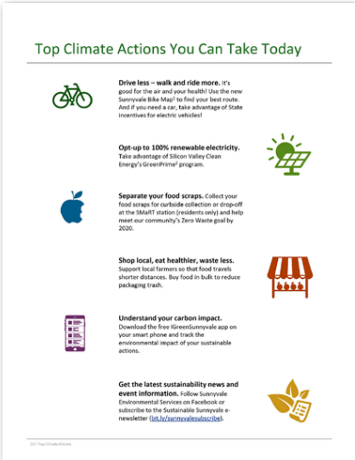
Get started with some simple climate actions you can take today!