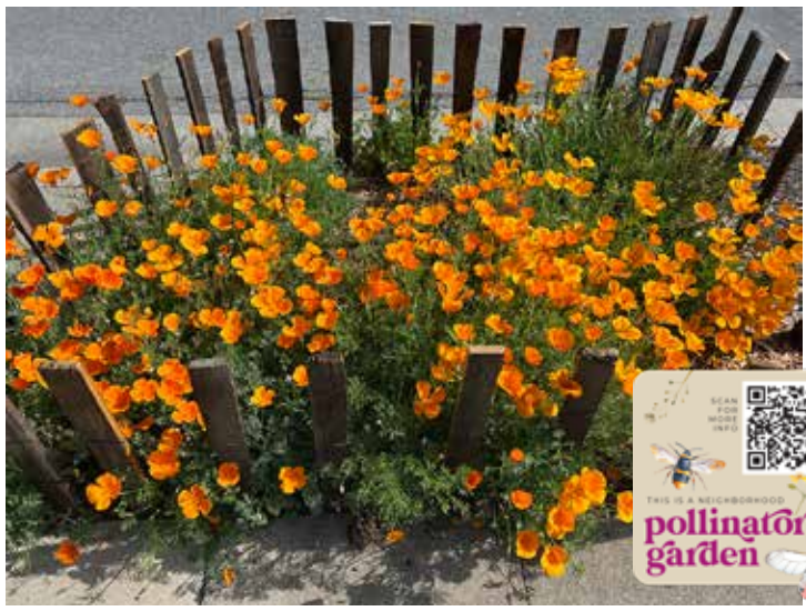
This year's mini pollinator garden display should be exceptional due to recent rains.

Our 2022 grant project is entering Year Two ! When walking in Cherryhill, be on the lookout for our mini pollinator gardens—identified by a small acrylic sign shown below. Find the pollinator garden map on our website and go for a self-guided spring tour!