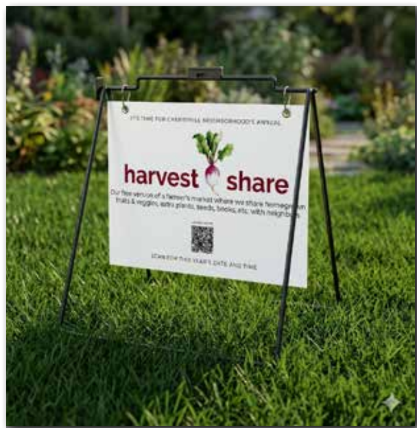
Our meeting/event signs will show up a week or two beforehand to give you advanced notice.